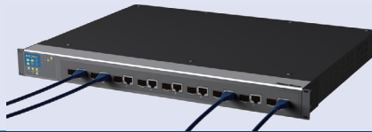
PT-G7509-F series (Front Cabling, Front Display)