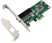
MicroConnect 1 port SFP Ethernet Server PCIe MPN: MC-PCIE-INT210