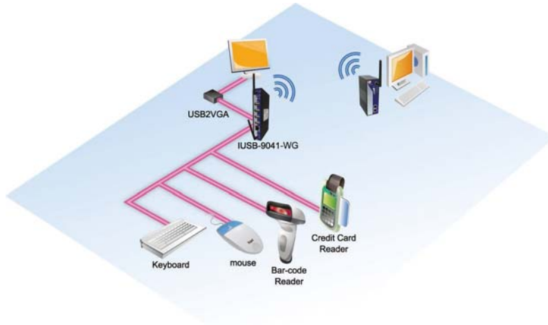
USB remote connectivity