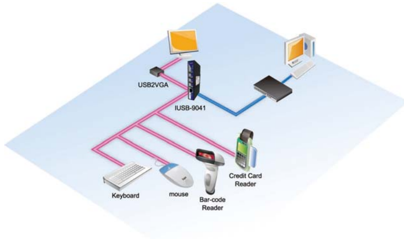
USB remote connectivity