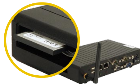
• CompactFlash opening on the side of the box with rubber cover.