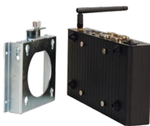
• 75mm VESA mounting hole at the back.